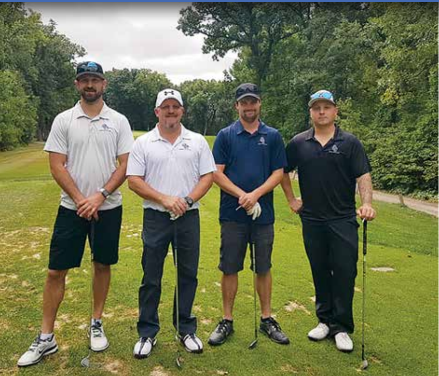
Some Bree-Dan staff enjoying a relaxing afternoon off for a round of Golf at Bridges, attending the Curtis Carpets Annual tournament.