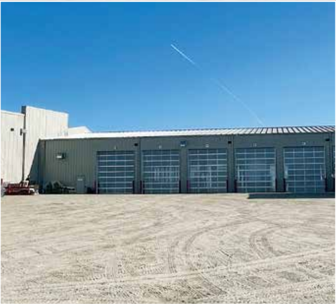
PBX Truck Service Office/Warehouse and Truck/Trailer Repair Shop Additions - Design-Build Project, Blumenort, MB. Getting close to finishing.