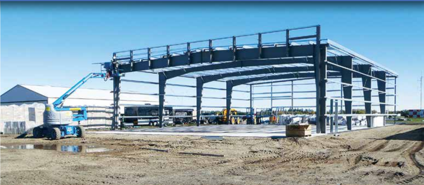
Hangar Building located within the Brandon Municipal Airport property. Beautiful summer day for ongoing construction.

“We very recently completed a project for PBX Truck Service in Blumenort, MB. We were recommended to PBX by another client due to projects we completed in Winnipeg. We presented our portfolio along with our own project ideas, which I’m happy to say were accepted. We designed it, built it, and ended with handing them the keys. This project was a design-build consisting