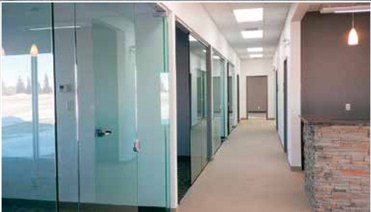
New Office Building for Renaissance Transport Ltd, Brandon, MB. Design-Build Project.