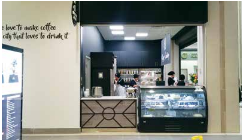
New Human Bean Coffee & Tea, Specialty Shop in Cityplace Mall.