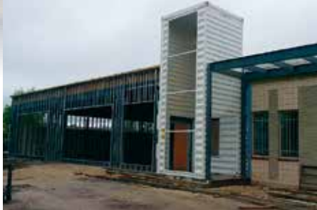
New Addition and Renovations Project completed for Manitoba Trucking Association at 25 Bunting Street, Winnipeg.

Bree-Dan Construction is a COR certified company which comes with a rigorous regime to uphold a comprehensive health and safety program. The Certificate of Recognition (COR®) Program is the ultimate accreditation to verify companies that have implemented a comprehensive health and safety program through the Construction Safety Association of Manitoba (CSAM)