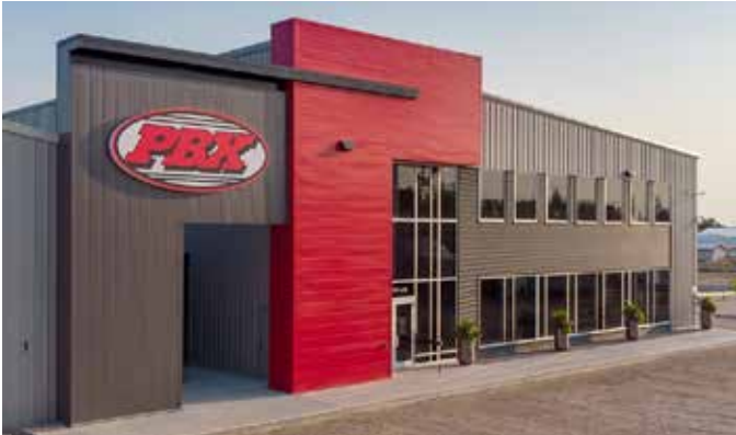
PBX - New Office Addition.