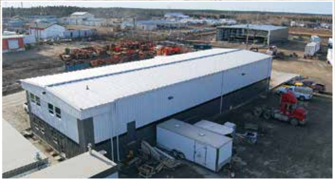
Gardewine, Thompson. New Office Addition, New Cross-Dock Addition, New Truck Storage and Wash-Bay Building, and Renovations to Warehouse Building.

related to the Transportation Industry we had to believe we would not be shut down. PBX Truck Service completes repairs, sells truck parts, and services these trucks which help to keep the Goods moving down the roads. We had several meetings to discuss whether the project should start in April as scheduled, and fortunately it was agreed to move forward. Good thing they did because the project material costs were normal at that time, but as we all know began to significantly increase soon after. There were however many delays such as waiting for our consultants and engineers as they worked to set up their remote offices in their homes, and of course the many materials and equipment delivery delays as we have all experienced. We ended up a few weeks behind on account of these delays, which also pushed the project to go into the winter months while we were still preparing to close in the structures, causing added expenses to provide heating and hoarding to our project.”