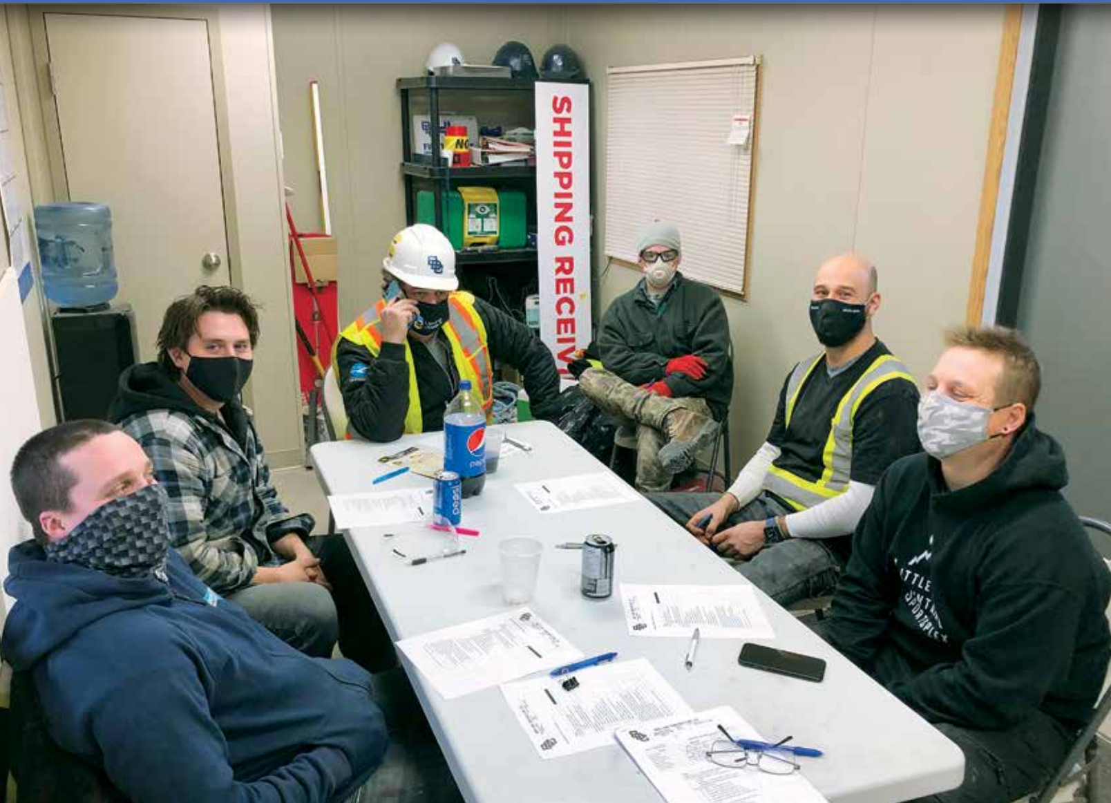
Bree-Dan regular Safety Meeting on site at the PBX project.