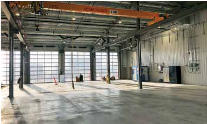
PBX - Truck & Trailer Shop Addition.