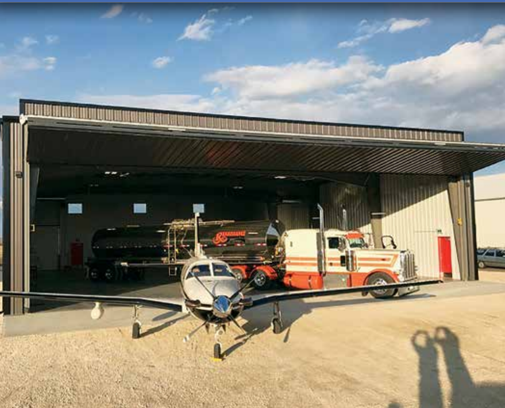
New 7500s.f. Hangar Building for a repeat client in Brandon, MB. Built with heated floors and large enough to store several planes and equipment through the 65’ wide by 18’ high automatic door.