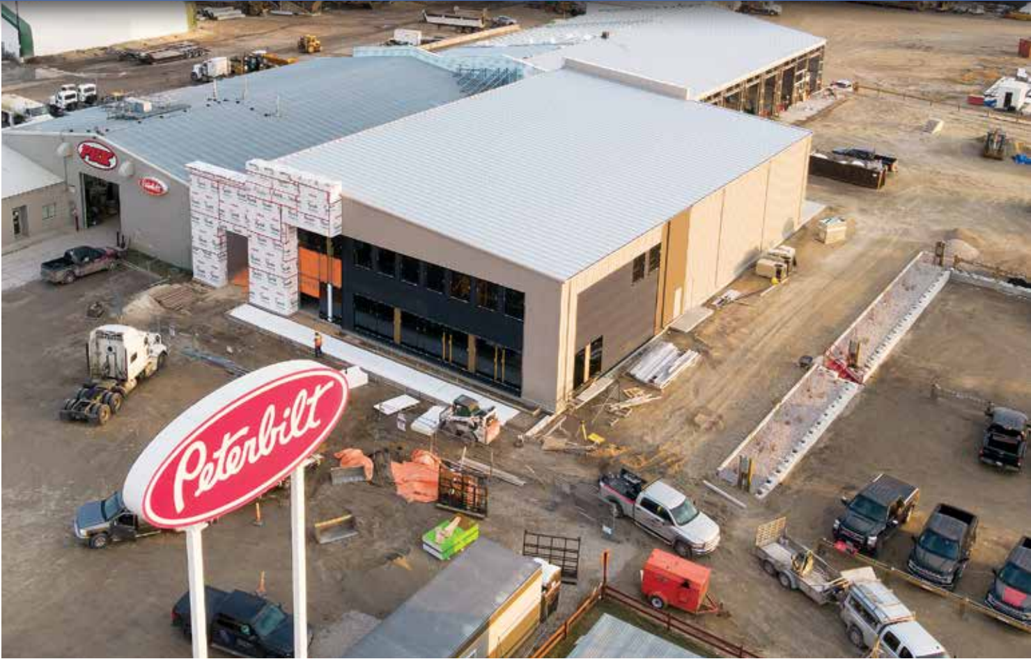
PBX Truck Service - mid-construction, early fall season.